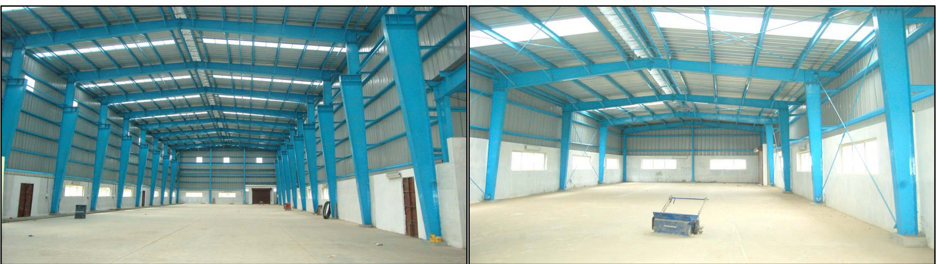
Production Hall: Height 24', Area 4,200 sq ft